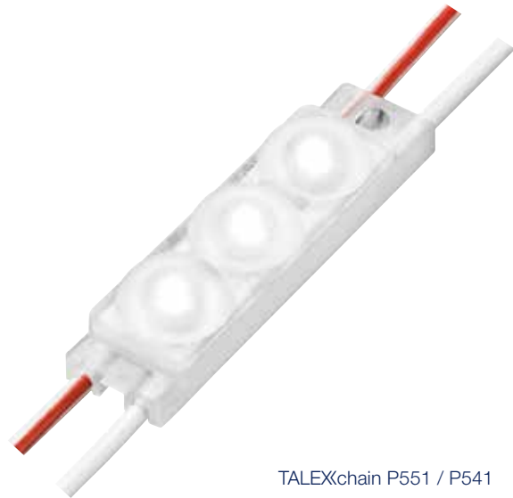
TALEXchain P551 / P541